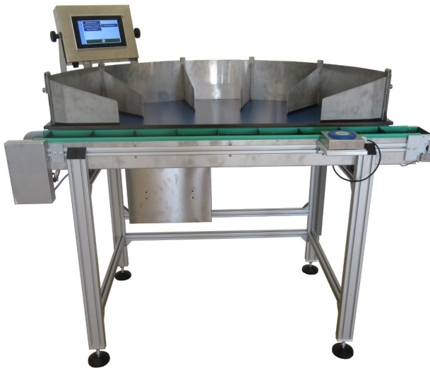
Picture 1: Sorting table with belt feeder, normally used as a feeder in a Lauper LVX packaging machine.