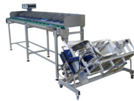
Picture 5: LBX100 Special Design, extra long, customized LBX100 sorting table.