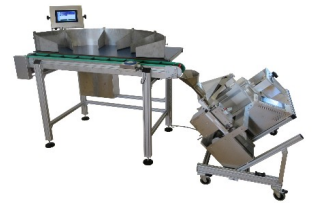
Picture 6: The LBX100 sorting table complements the LVX300 packaging machine to create a versatile packaging workstation.