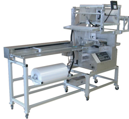
Picture 2: LHX550 standard, with 1000mm in-feeder, printer frame, and support frame on wheels