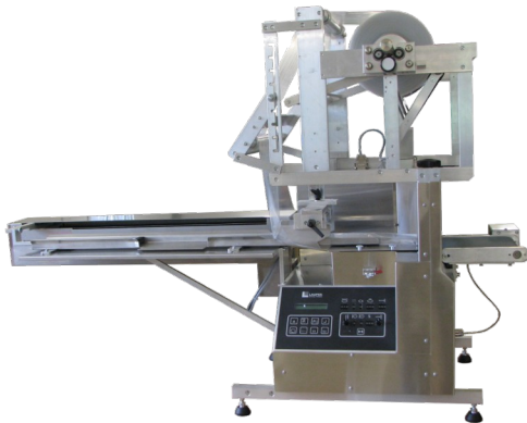
Picture 1: LHX350 standard, with 800mm in-feeder, w/o support frame (only for 800mm in-feeder)

Lauper horizontal packaging machines of the latest LHX generation impress with their simple operation and the consistently implemented modular design. All of our packaging machines are completely developed, manufactured and produced in-house.