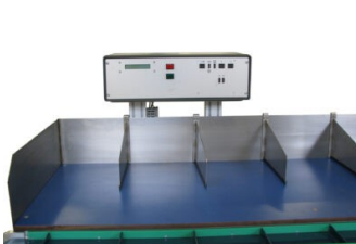
Picture 3: LB100 Control Unit, consistent control unit for each individual design.