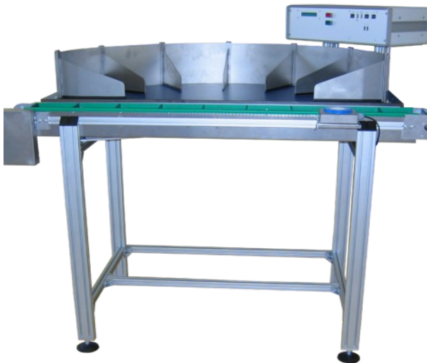
Picture 1: Sortiertisch mit Bandzuführung, normalerweise als Zuführung in eine Lauper LVX Verpackungsmaschine