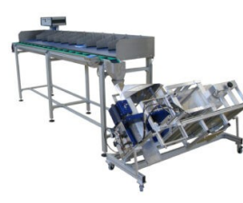
Picture 5: LB100 Special Design, extra long, customized LB100 sorting table.