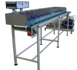
Picture 6: LB100 Special Design, extra long, customized LB100 sorting table.