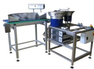
Picture 4: LB100 Complete System, packaging system combined with a LB100 sorting table and two bowl feeders.