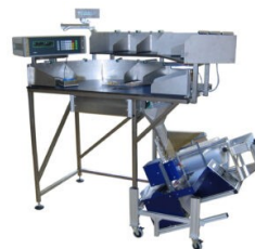
Picture 5: LT100 - 1Count control table with 12 components followed by an Lauper LV500 packaging machine.