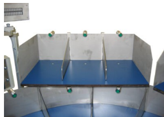
Picture 4: LT100 - modular design, due to the modular design, we are able to fulfill your needs.