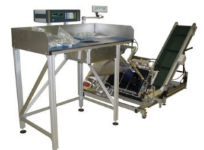
Picture 6: LT100 - complete system, simple count control table followed by a LV500 packaging machine and a conveyor belt.