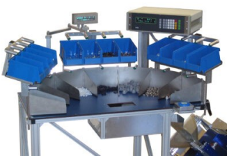
Picture 3: LT100 count control table with 20 different parts. Green lights will guide you through the counting operation.

The LT100 count control table is modular and can be configured to your requirements. Let the examples inspire you.