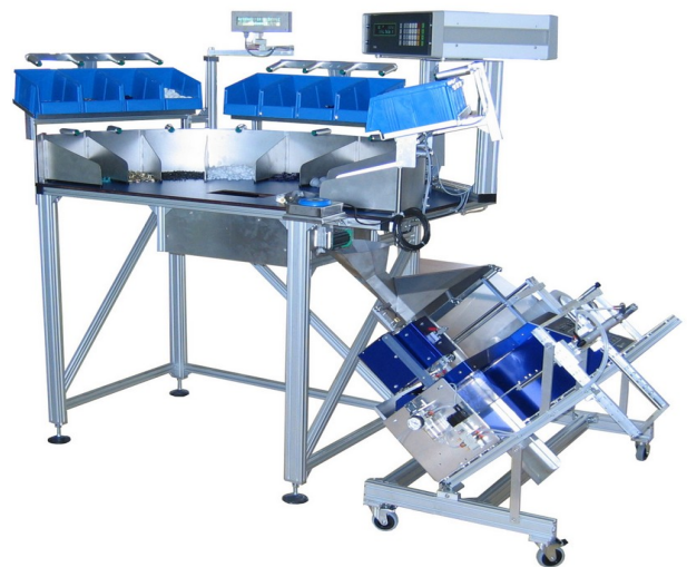
Picture 2: LT100 - complete system, count control table with 20 components followed by an Lauper LV300 packaging machine.