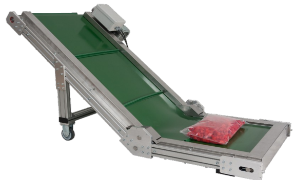
Picture 2: LC100 (400x1000), Conveyor Belt, example with conveying width of 400 mm and conveying distance of 1000 mm

Note: All dimensions in Table 1-3 are in [mm].